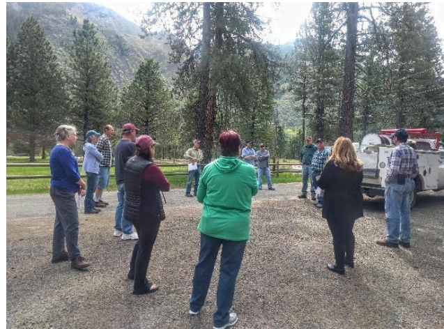
Lostine Canyon Community on Wildfire Preparedness Day